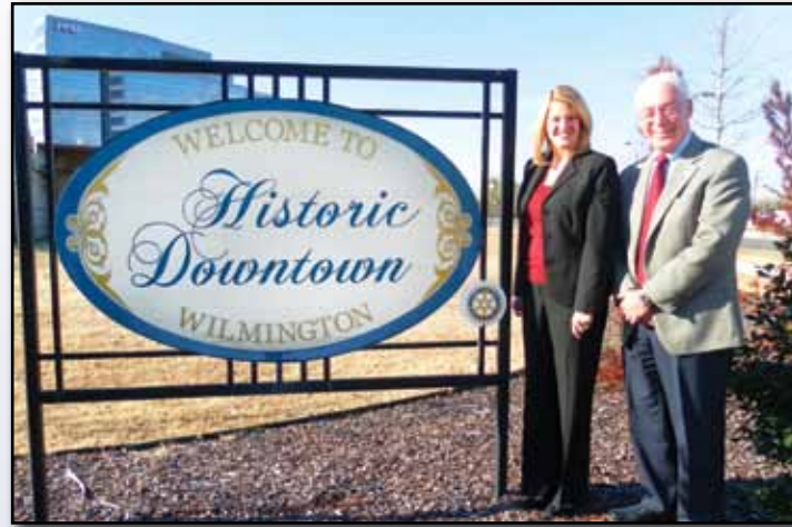
This Historic Downtown Wilmington marker at 3rd & Front Streets is one of the signs given by our club to the city in 2005, commemorating Rotary International's centennial year.